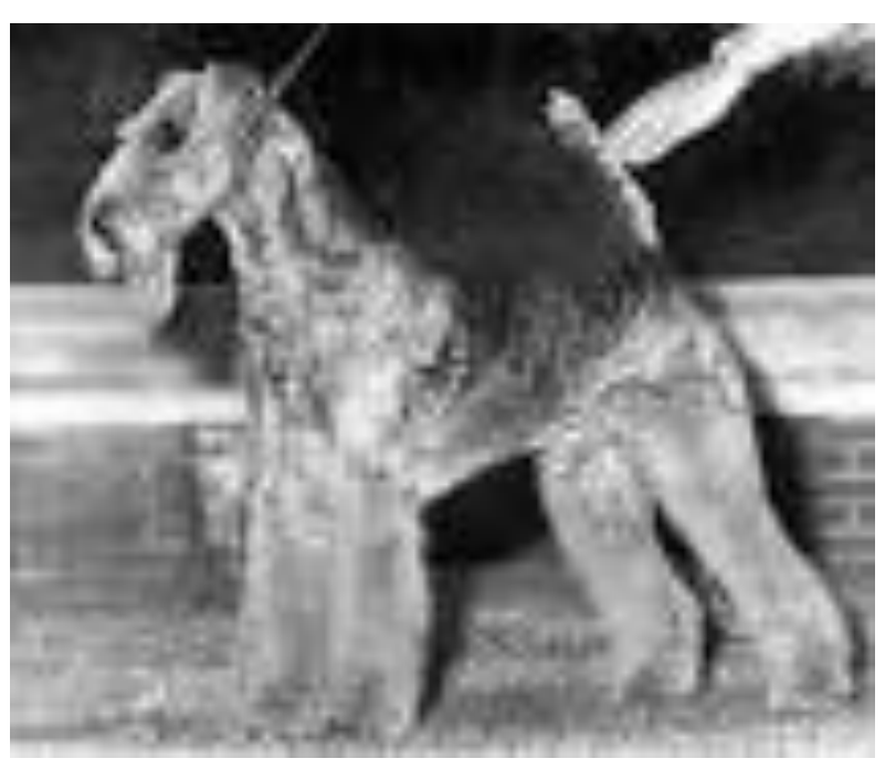
As a breeder I think we need to have a picture of the Ideal Airedale etched in our mind so that we can